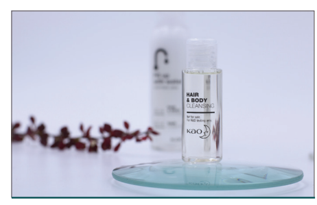
FORMULATION 2: HAIR & BODY DILUTABLE CLEANSING

■ Hair & Body dilutable Cleansing (ref. C-321) Our sustainable proposal is an ultra-mild foaming concentrated Hair & Body Cleanser. This product is made in concentrate form to be mixed with water for consumption. A clear viscous hair & body shampoo is obtained placing 30 mL in an empty 100 mL bottle, adding tap water and shaking it. This new formula represents a step forward towards our commitment to create environmentally-friendly solutions that meet the needs of our customers.