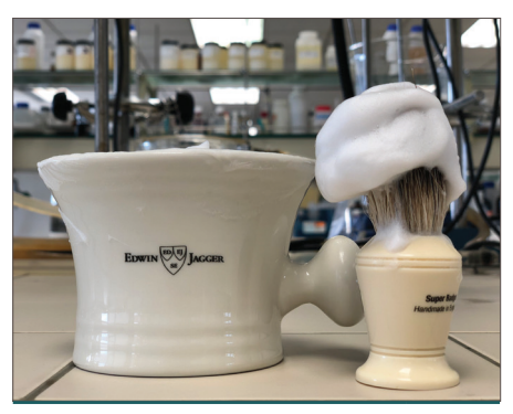
FORMULATION 3: SHAVING CREAM ULTRA-MILD